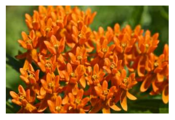
Butterfly Weed , <u>Asclepias</u> <u>tuberosa</u>, close-up of the flowers