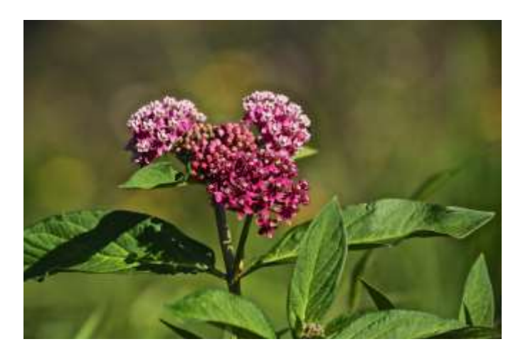
Showy, Swamp, Rose Milkweed , various names for this beautiful rose-colored Milkweed, <u>Asclepias incarnata</u>, © Dick Harlow

There are 12 native species of Milkweed found throughout North America, all used by Monarch butterfly larva. I will focus on those species that are primarily found from the Mid-West to the East coast. You have already been introduced to Butterfly Weed.