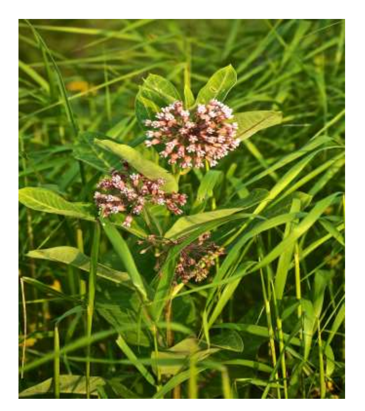
Common Milkweed , <u>Asclepias</u> <u>syriaca</u>, found throughout the Northeast in fields and meadows.

Milkweed is considered a weed by many people. However, there also are others who consider Milkweed as an interesting and colorful flowering perennial. And, then there are those who support the gardening of Milkweeds of various species because they provide the fodder for the Monarch butterfly larva!