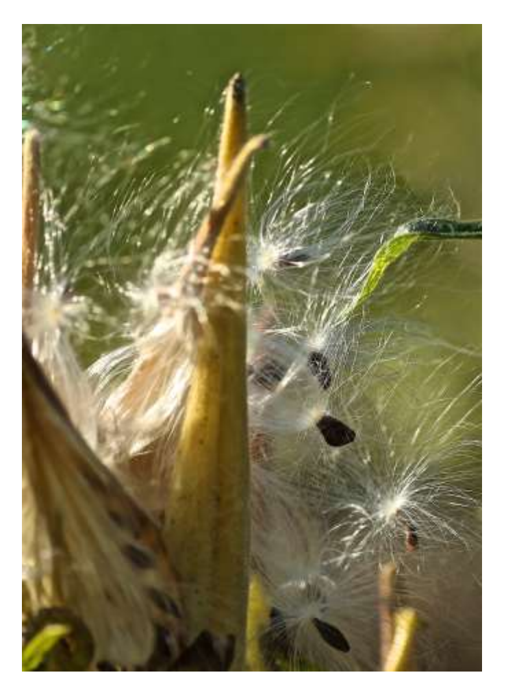
Butterfly Weed <u>Asclepias</u> <u>tuberosa</u>, long cylindrical pod and seeds that form after flowering.