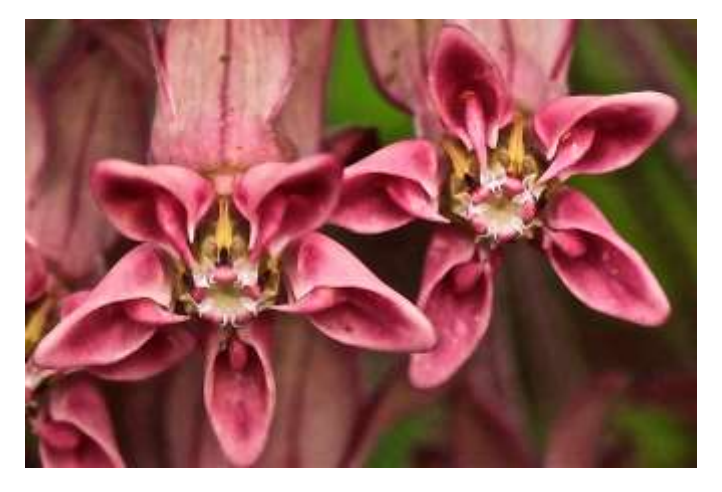
Showy, Swamp, Rose Milkweed , close-up of the individual flower, <u>Asclepias incarnata</u>

There are other milkweed species, but the three species shown here are the foremost species of milkweeds in the East for helping the Monarch Butterfly!