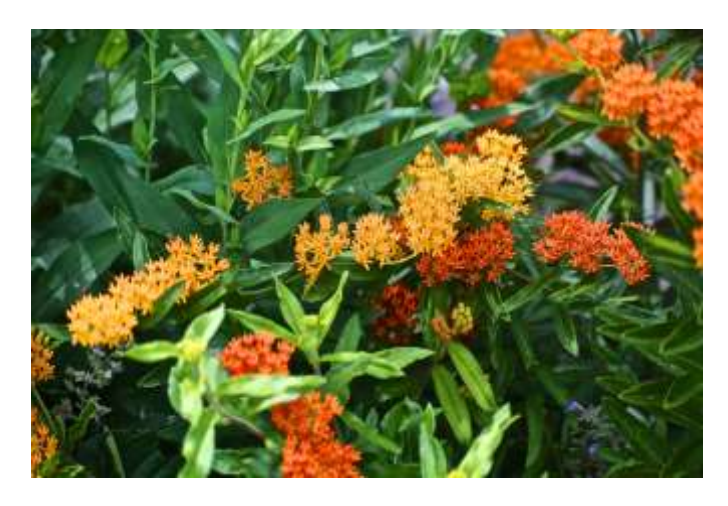
Butterfly Weed , <u>Asclepias</u> <u>tuberosa</u>, Orange and yellow perennial variations