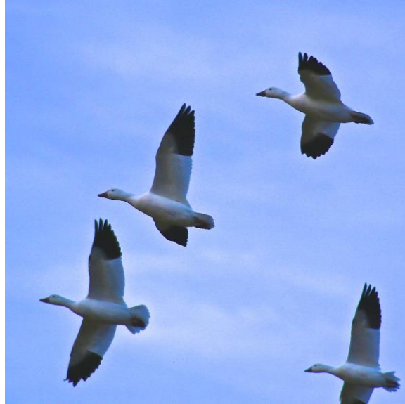
(2) Snow Geese at the Goose Viewing area, Rt. 17 Addison

Picture 1 shows the large, 3,000 – 5,000 flock of Snow Geese at the Goose Viewing area on Rt 17 in Addison. This picture was taken at 500X, so this flock is some distance in back of the goose viewing area. However, the geese moved closer and started to feed on the corn-harvested field very near the road by the goose-viewing platform.