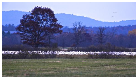
(1) Snow Geese at the Goose Viewing area, Rt. 17 Addison

Pictures taken early morning of November 3, 2015