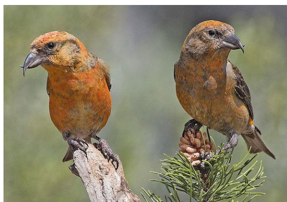
Red Crossbills, Loxia curvirostra

Generally, he expects that we could see White-winged and Red Crossbills , along with Pine Siskins , at our Nijar feeders. This is primarily due to spruce seed being heaviest in eastern and western North America, but not in northern Canada.