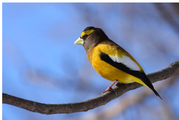
Evening Grosbeak, Male, Coccothraustes vespertinus

Evening Grosbeak , is a large showy grosbeak, especially the males, and could be seen here in Vermont this year. I used to band, (putting marked F&W aluminum rings on their legs), many Evening Grosbeaks in the 1960's and 70's. If they come to our feeders this winter they will be a beautiful and wonderful addition to our winter birds.