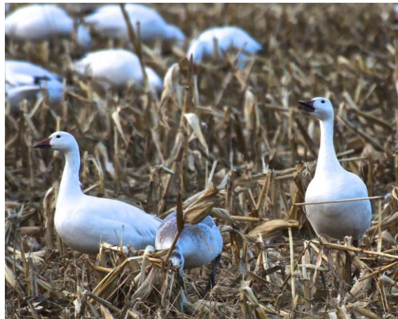
(3) Snow Geese at the Goose Viewing area, Rt. 17 Addison

Picture 3 is a close view of geese feeding on corn next to the fence beside the parallel dirt road that runs by the Goose Viewing Platform.