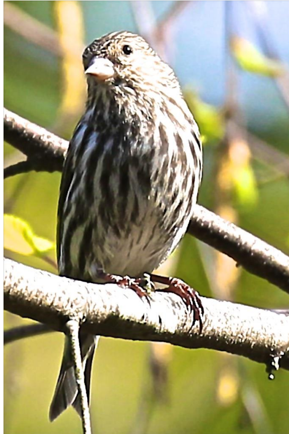
Pine Siskin, Spinus pinus

Let's start with an edited summary of the Winter Finch Forecast put out by Ron Pittaway of the Ontario Field Ornithologists from Toronto, Ontario Canada. Of course his forecast is primarily for Canada, and the northern states in the lower 48. Because many movements of finches and northern birds are dependent on food supply during winter, it is important for birders to know what is going on in Canada; what is the available seed crop from various trees and what is the condition of Canada's spruce/fir forests relative to the spruce bud worm.