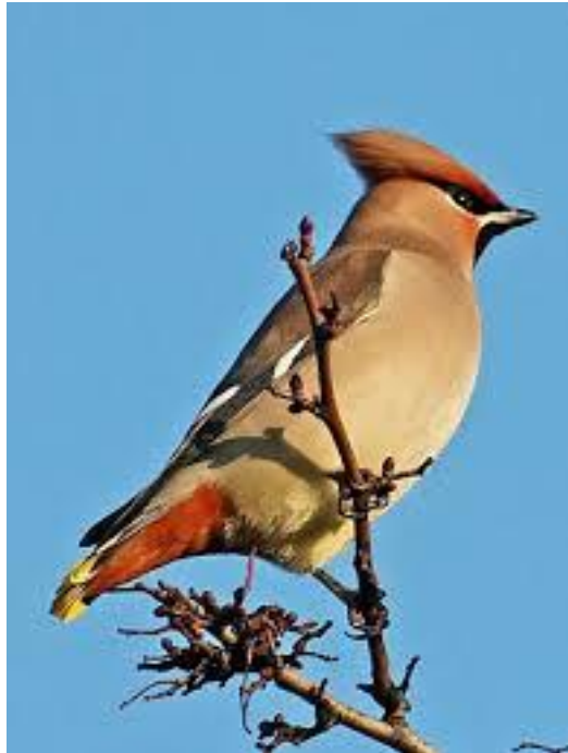
Bohemian Waxwing, Bombycilla garrulus

There are several identification marks to look for when trying to distinguish a Bohemian from our common Cedar Waxwing. Bohemians are larger, have a grayer back, and have yellow on the outer edges of their primaries. There is no yellow on the outer primaries of the Cedar Waxwings. In my mind the single most important characteristic to look for is their rusty brown under-tail coverts of the Bohemian Waxwing . Cedar Waxwing has white under-tail coverts. When in doubt, look for those under-tail coverts.