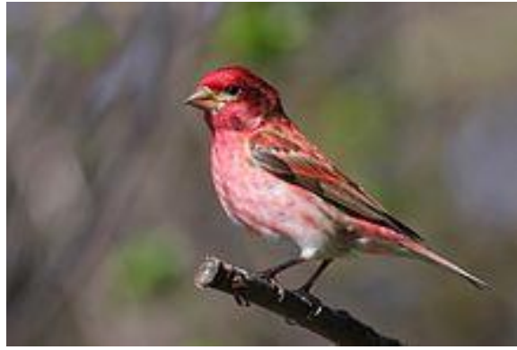
Purple Finch, Male, Carpodacus purpureus