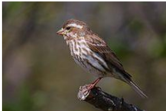
Purple Finch, Female, Carpodacus purpureus

Purple Finches , from Canada should be coming down to the New England states as the seed crop is low in Canada. When trying to decide whether you are looking at a Purple Finch or a House Finch , look at the tail. In a Purple Finch it is distinctly either forked or notched, whereas in a House Finch the tail is flat or squared off. Purple Finches prefer Sunflower seed at feeders.