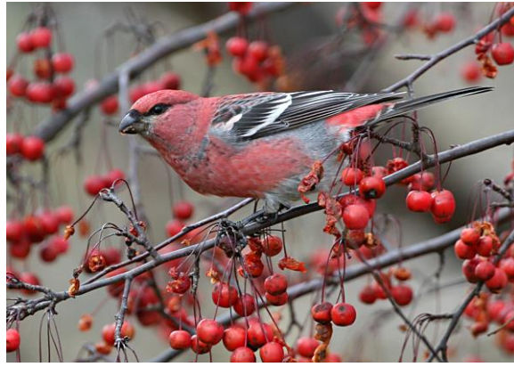
Pine Grosbeak, Pinicola enucleator

Notice the pinkish-red color of the male, fairly striking with white wing bars. The females are not red; they are dull gray on back and breast, yellowish-green on the head and back of the neck.