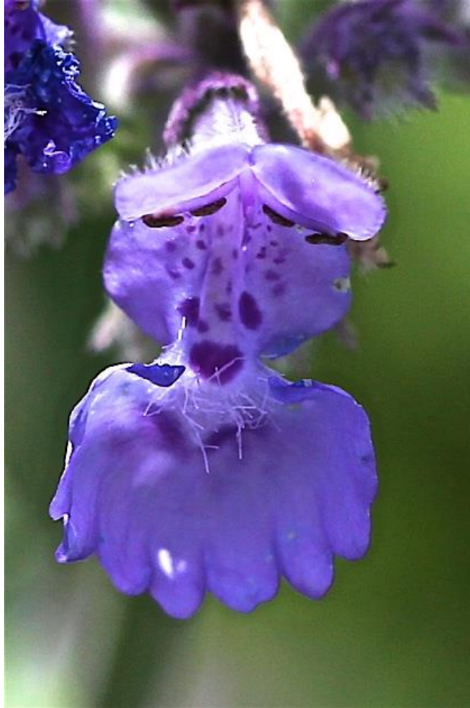
Catmint, Nepeta racemosa , single blossom

The raceme of flowers looks large as a group, but as a single flower each individual one is small; but when the image is enlarged it is almost orchid-like.