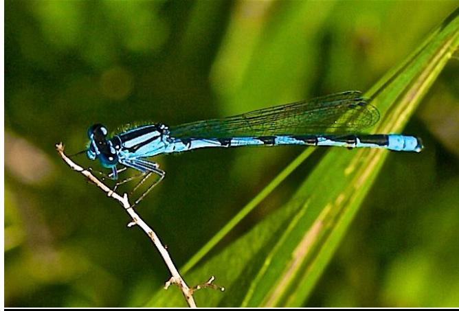
Marsh Bluet, Enallagma eribium , male

This small blue and black damselfly belongs to the Pond Damselfly Family and looks similar to many of the pond damsels. Here at EastView's South Pond most of the bluets will be seen near if not at the edge of the pond. When viewing a damselfly in the field or on a grass stem it is very difficult, if not impossible, to identify the bluets to species. However, brought back to a lab or to your microscope and reference material these fellows can be determined to species.