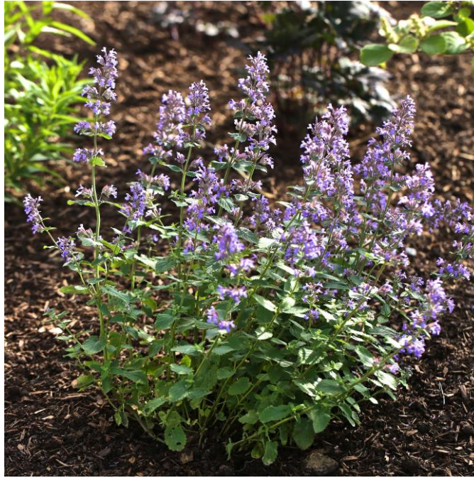
Catmint , Nepeta racemosa , garden perennial

All mint plants have a square stem and emit an odor. Catmint or Nepeta racemosa is a dwarf mint or herbaceous perennial. If you pick a leaf there is an aromatic odor to it, which is enhanced by crushing the leaf. Many mints grow tall, but this mint grows about a foot tall with violet or lilac-blue summer flowers. Interesting that this plant contains nepetalactone, which repels cockroaches and mosquitoes, yet butterflies will nectar from the flowers.