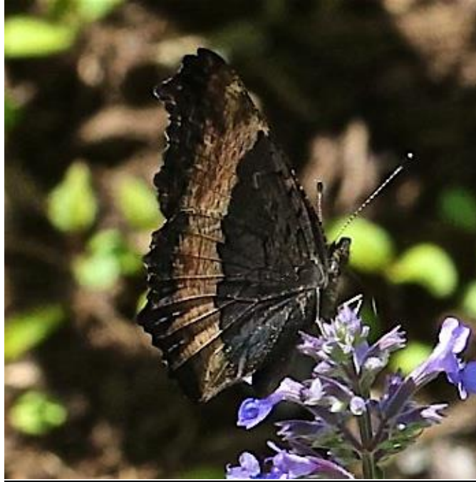
Milbert's Tortoiseshell, Nymphalis milberti Ventral View

For me to have this fellow visit our garden in June and specifically feed on the Catmint is a rarity. Although I have seen this species further north, this year was my first for Middlebury.