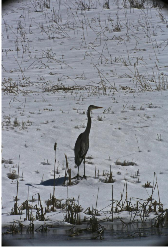
Great Blue Heron, Ardea herodias