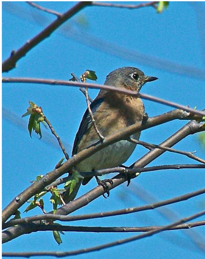
Eastern Bluebird , female, © Dick Harlow

Bluebirds that checked out the bird boxes in February will now be more aggressively staking out the area around the box that they plan to defend. The only “fly in the ointment” is the European Starling pair or House Sparrow pair that have decided they want the same box. Unfortunately, both Starlings and House Sparrows also aggressively defend their box and will start defending it earlier than bluebirds. The other problem is that if a House Sparrow nest is successfully eliminated by humans, (i.e. removing the nest and cleaning out the box), they will harass and or kill occupants of another box so that they will end up taking over two boxes instead of one.