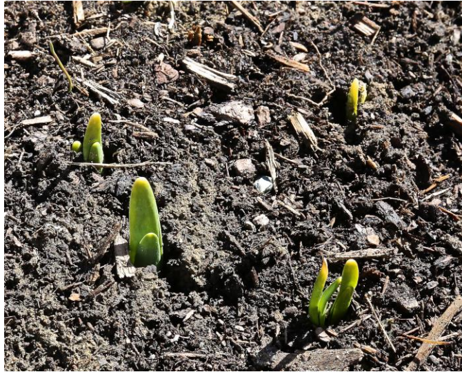
(1) Narcissus poking up early in March

Meteorologically, March is the first month of spring! Temperatures are moderating between warm and cold, melting snow and thawing ground and ice brings on the mud season. Occasional snowfall and periodic rain let everyone know winter isn't finished even if we would like it to be. Trees are waking, buds are swelling which suggest tree and shrub sap is moving through their veins carrying stored nutrients for the leaf buds so they can open at the most opportune moment.