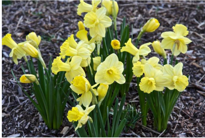
(3) Daffodils, Narcissus , in full flower

shoots of living new green blades of grass. Weed seeds that you haven't given a thought to over this winter, will now be sprouting and asking you to renew your vow to keep them under control.