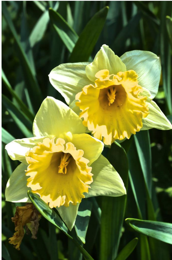
(4) Daffodils, Narcissus , in full flower close-up .

But soon, pictures (3) and (4), will be showing themselves in many EastView gardens.