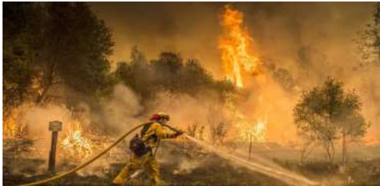
© Climate Change editorial.JPG CA fires.

We will look at some of the things that we could experience here in Vermont as the climate warms up. Some are common sense, but all should be informative.